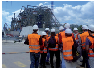
Vinci Construction : visite Musée de la Confluence 15 mai 2012

The Department of Civil Engineering and Urban Planning provides education in the scientific and technical fields of civil engineering and urban planning: